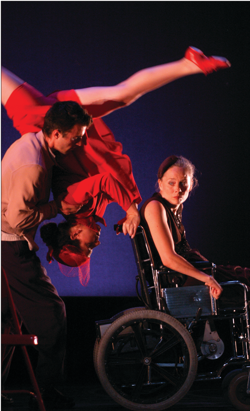
Axis Dance Company features dancers with and without disabilities.

Before you show Including Samuel to your students, colleagues, family or neighbors, think about these questions, discuss with another person, or discuss in a group.